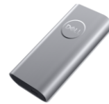
Dell Portable Thunderbolt™ 3 SSD, 500GB (SD1-T0500)(M)